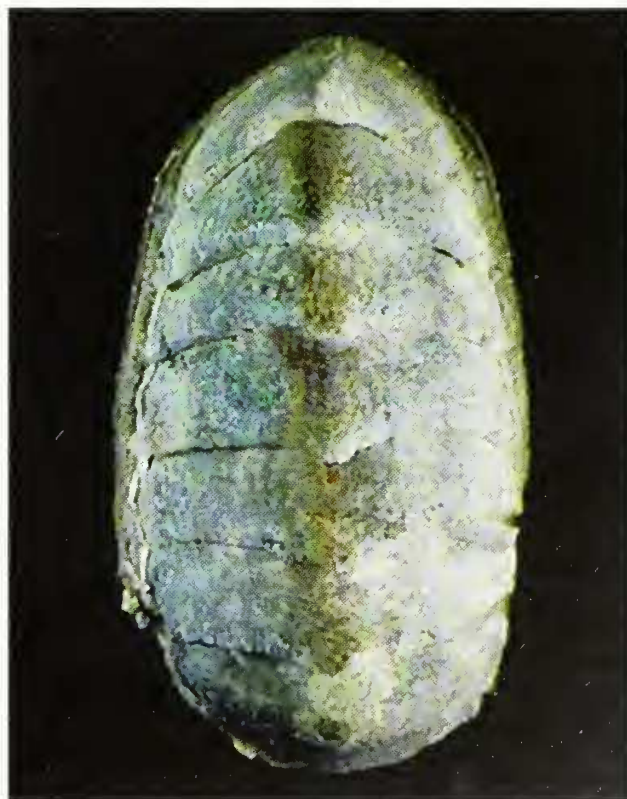
Fig. 3. L. furtiva (3.6 × 1.9 mm).

mediate plates. Dell'Angelo & Forli (1996:43,45) reported that the shape of the valves in this species presents some similarities with the valves of the fossil Pliocene Lepidochitona verrucosa Dell'Angelo & Forli, 1996. L. furtiva lives between the leaves of P. oceanica , a few centimetres above the roots (Strack, 1988).